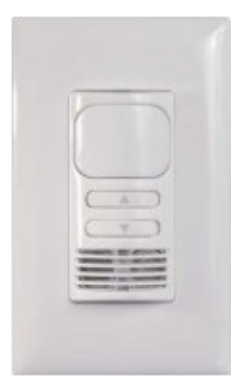
DUAL TECHNOLOGY SHOWN