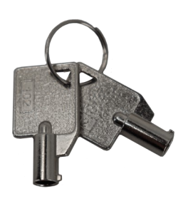
TWO KEYS INCLUDED WITH EACH SWITCH