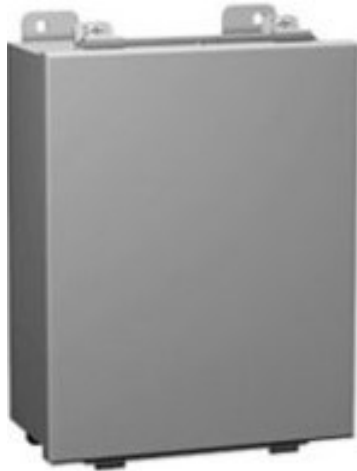
EXTERIOR NEMA 12 ENCLOSURE