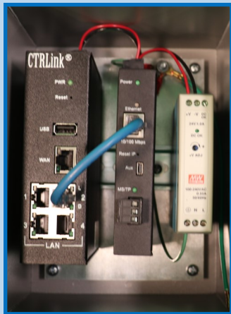
INTERIOR VIEW SHOWN WITH BACNET OPTION